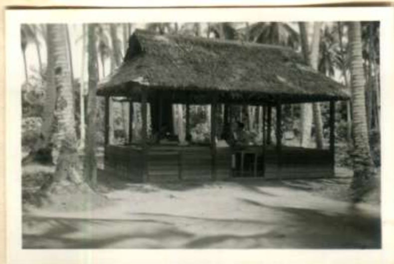
15. The Meeting Place For Pondok Students or Tempat Berjumaah. Kota Bharu.