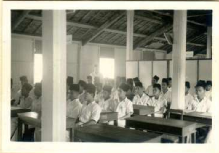
6. Classroom - Madrasah Sultan Zainal Abidin