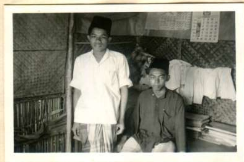
14. Inside A Pondok In Kuala Trengganu