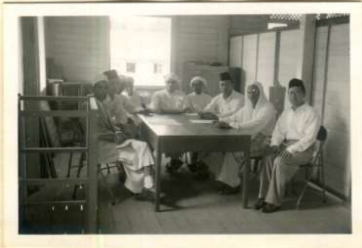
7. Teachers Of Madrasah Sultan Zainal Abidin