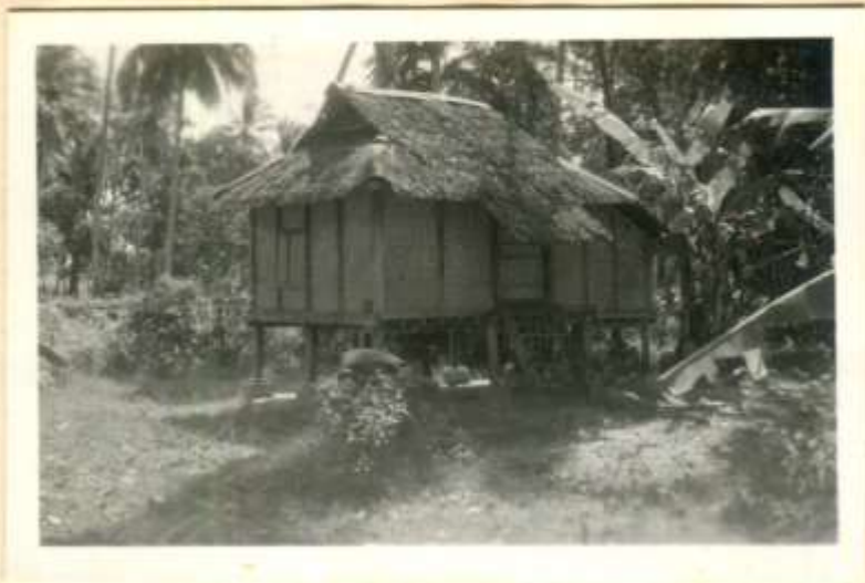
13. A Pondok In Perlis