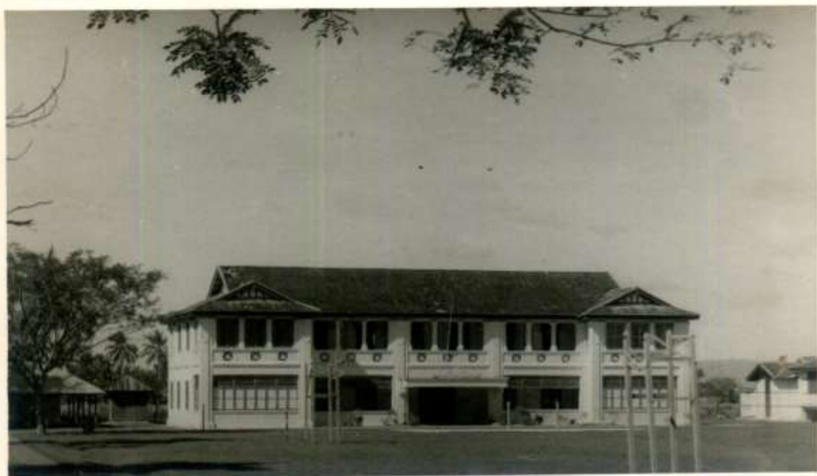
3. Madrasah Al-'Alawiah, Perlis.