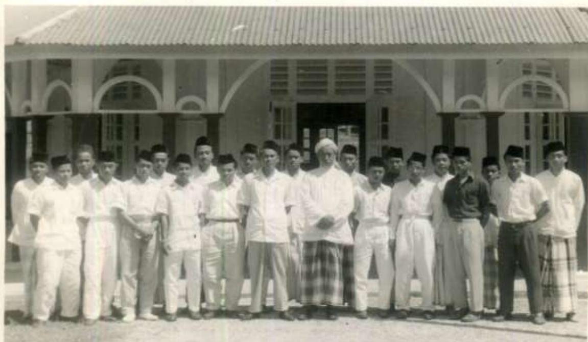
4. Senior Students Of Madrasah Idrisiah, Kuala Kangsar. (With Their Headmaster and Form Teacher).