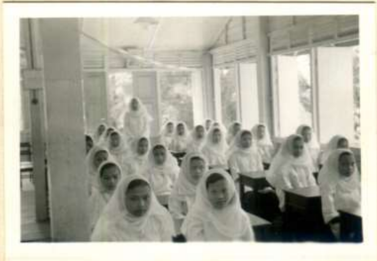
8. Classroom - Madrasah Khairiah, K. Trenggani.