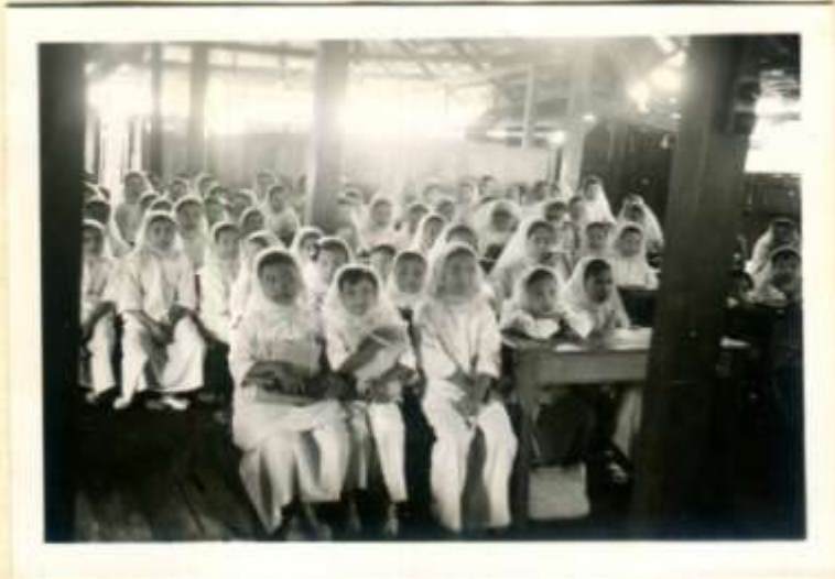
9. Classroom - Madrasah An-Nain lil Barat, K. Bharu.