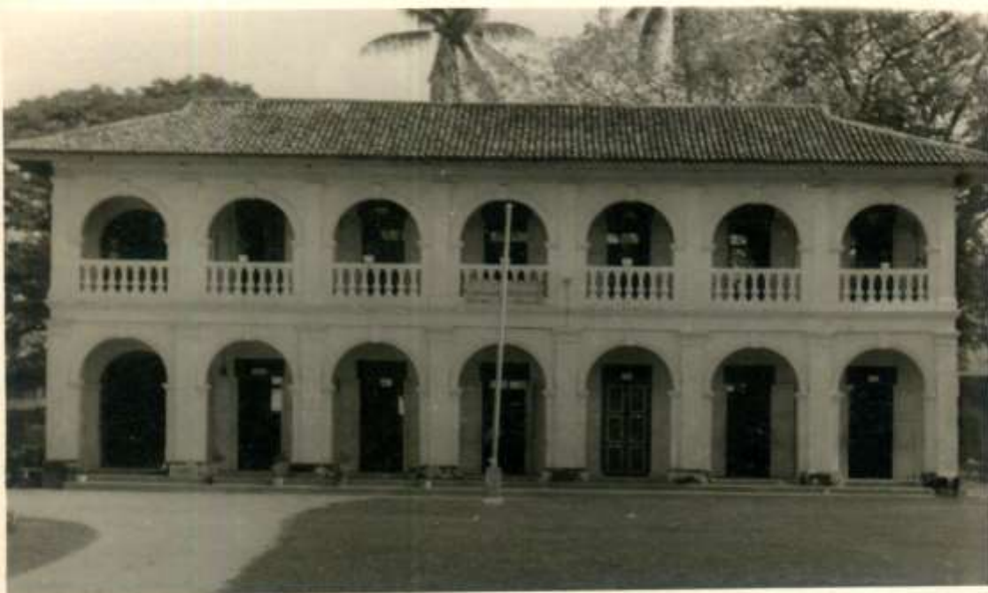
1. Madrasah Al-Mashor, Penang.