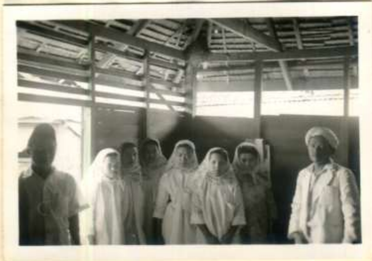
10. Teachers Of Madrasah An-Nain lil Barat.