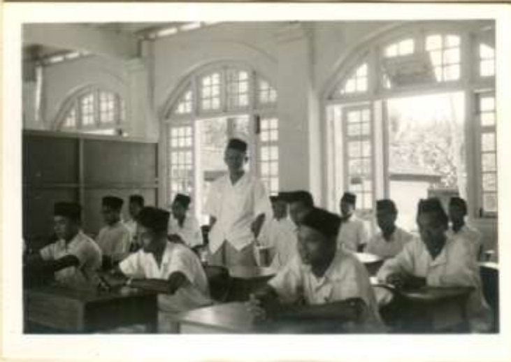
5. Classroom - Madrasah Idrisiah